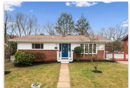
3604 Sandy Ct Kensington/Newport Hills Sold - $725,000