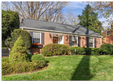
10006 Frederick Ave Kensington/Newport Hills Sold - $829,000