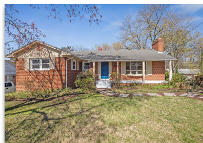
9327 Limestone Pl College Park/College Park Woods Sold - $620,000