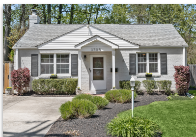
3705 Adams Dr Silver Spring/Connecticut Gardens Under Contract - $619,000