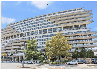
2700 Virginia Ave 910 Washington DC/Watergate Coming Soon