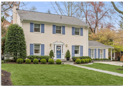
9711 Culver St Kensington/Rock Creek Highlands Sold - $1,412,500