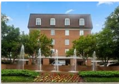
8101 Connecticut Ave N-506 Chevy Chase Sold - $730,000