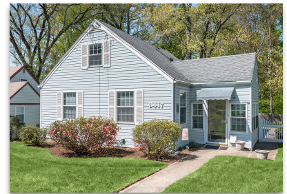
3417 Wake Dr Kensington/Kensington Under Contract - $795,000